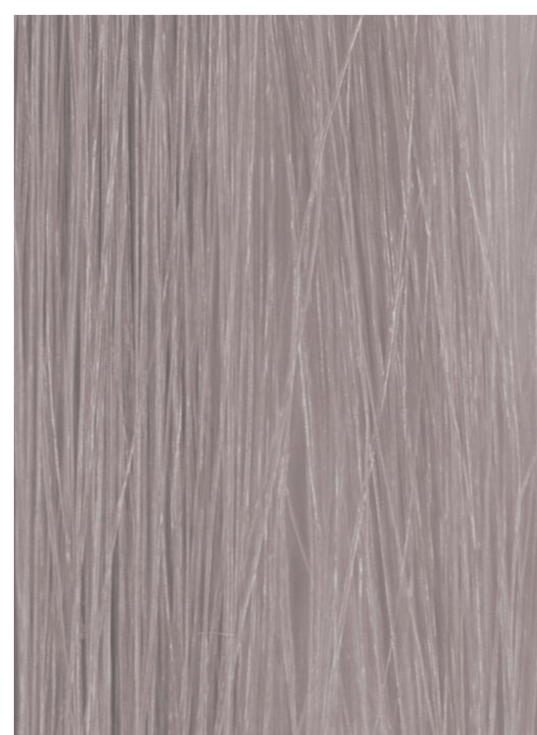
Platinum blonde Ice violet