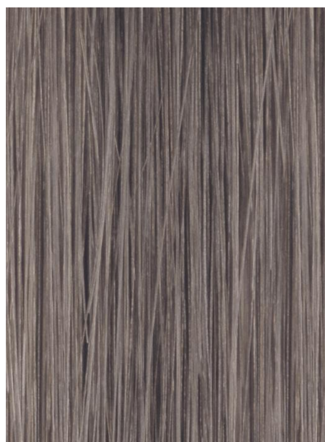
Blonde Ice violet